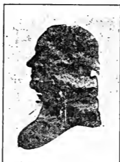
GEN. JOHN NEVILLE (Silhouette.)